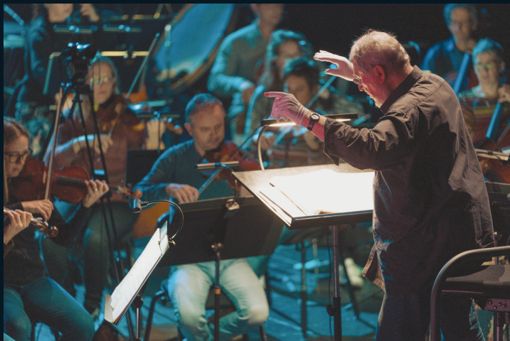
HK Gruber on Weill's Symphonies