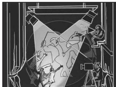
Los 7 Pecados Capitales